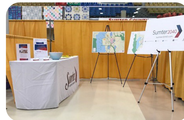
Photo: Display at Sumter County Fair