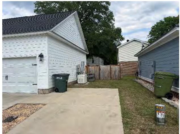
Above: Image from across the street