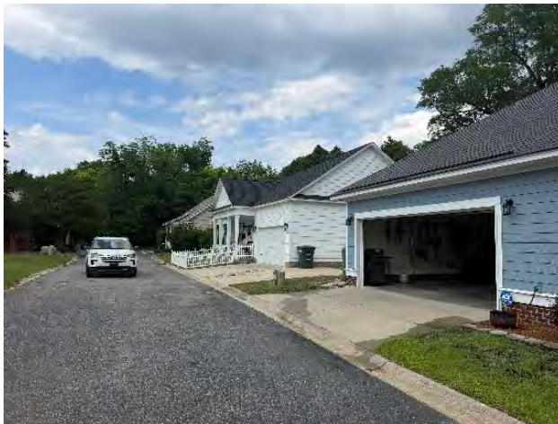
Above: Image from the entrance

Design review approvals were previously granted for the site via HP-22-20 , HP-22-20 (Rev1) , HP-24-01 , and HP-25-17 .