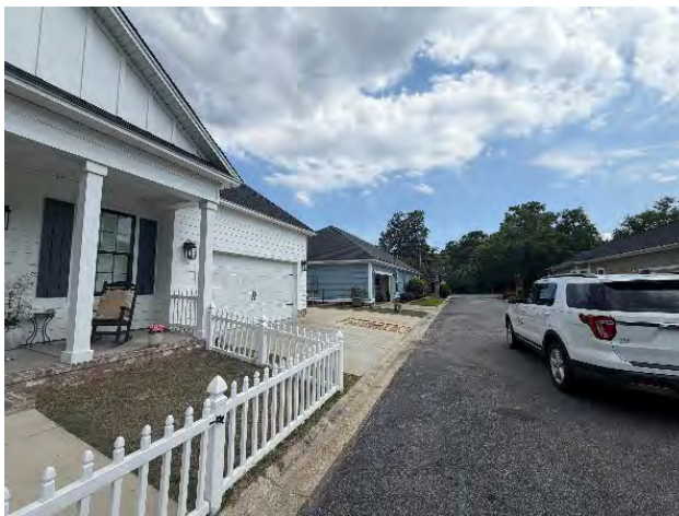
Above: Image from the end of the road