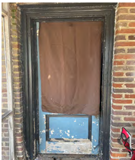
Half Light Existing Door