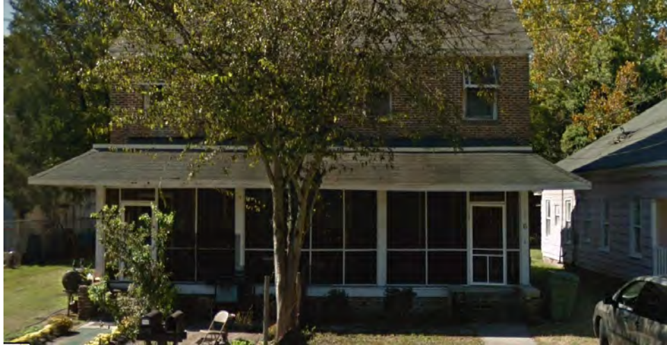
Above: 2012 Street View