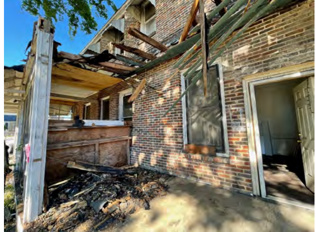
Partial Demolition prior to Stop Work Order