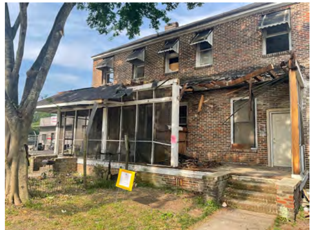
Site Front as viewed from Church St.