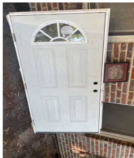
Proposed New White Sunburst