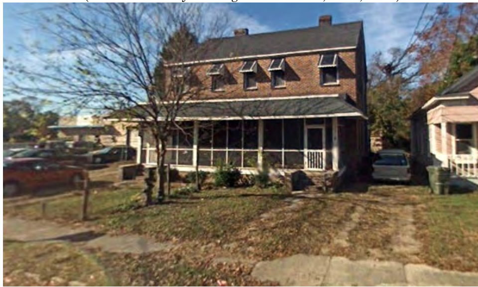
Above: 2007 Street View