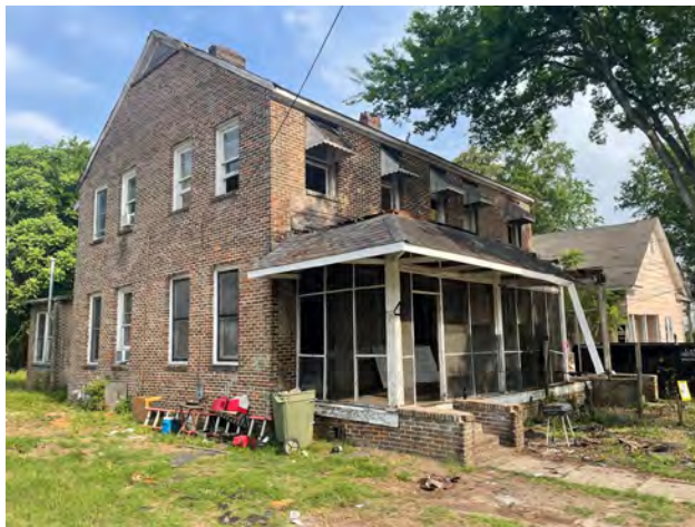
Site Front as viewed from Church St.

The following photographs show the existing conditions at the site.