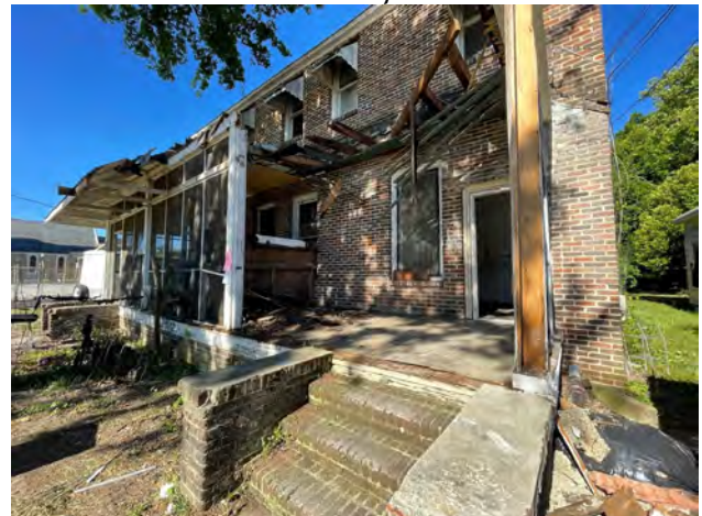
Porch Decking and front steps